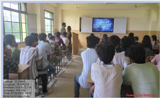
Students watching informative video on Kargil Vijay Diwas