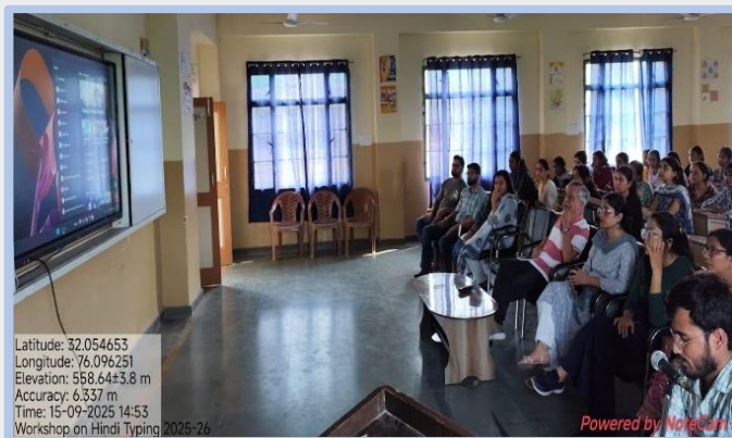
Workshop in Hindi Typing