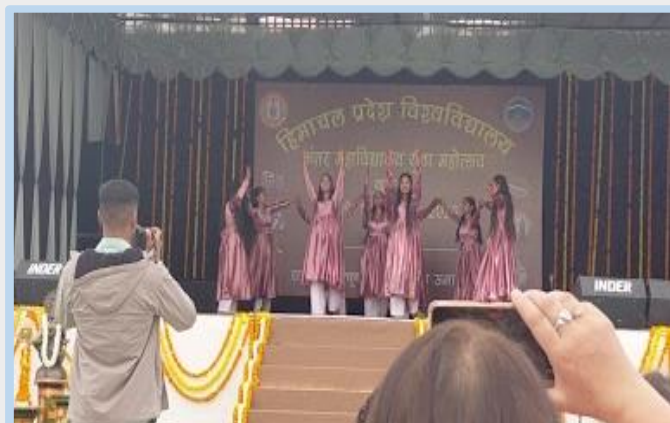
Students performing in Group 3 of HPU intercollege youth festival held at GC Una.