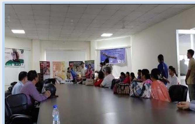
Students receiving 2 nd prize in quiz competition on vulture awareness